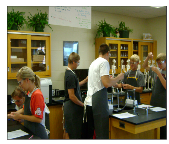
Medical Intervention students performing an ELISA test.

reinforce biomedical techniques learned in previous biomedical courses. One such diagnostic test that students learn about in Medical Interventions is the Enzyme-Linked Immunosorbant Assay, or ELISA